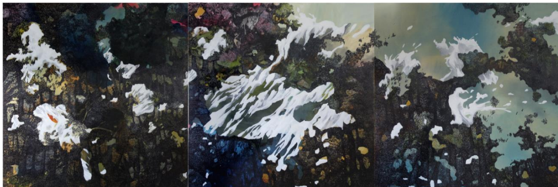
Kemalezedine · Tales of Balinese painting · 2021 · Ink and oil on canvas · 200x200 (3 panels)