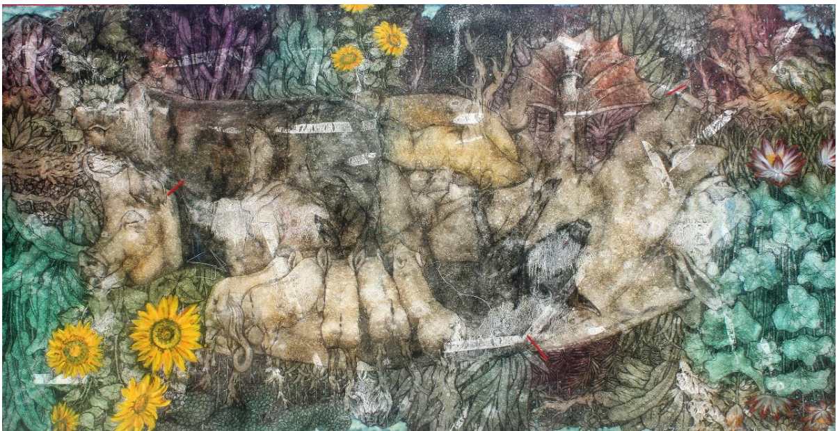
Ida Bagus Putu Purwa · 2019 · Harmony · Charcoal and oil on canvas · 200 x 400 cm