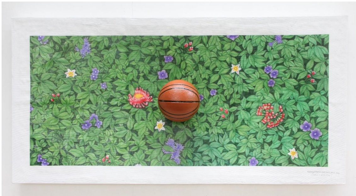
Entang Wiharso · Painting Hit by a Basketball · 2020 · Car Paint on Aluminum · 98 x 196 x 31 cm