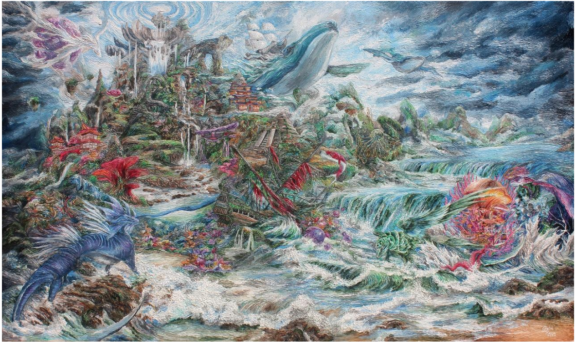
Disclosure of Leviathan · 2020 · acrylic on canvas · 180 x 300 cm