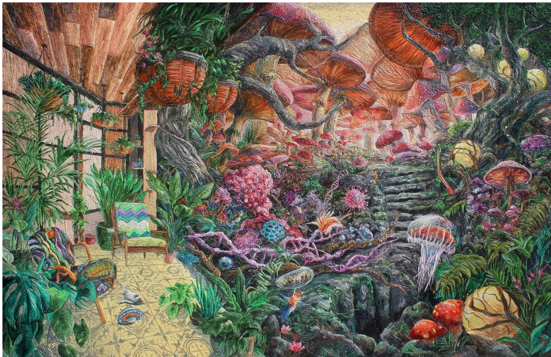
Sintesa Semalam · 2020 · acrylic on canvas · 200 x 300 cm