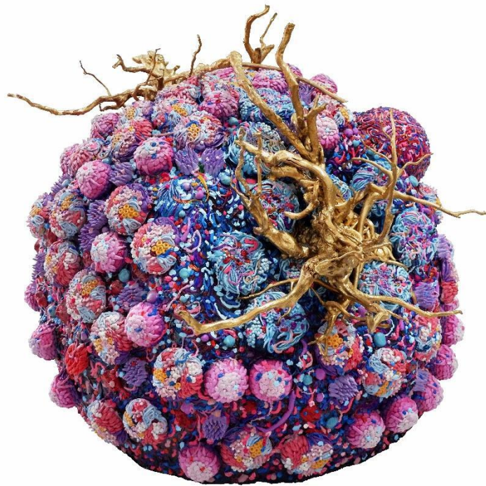
The Symptom_2 · 2020