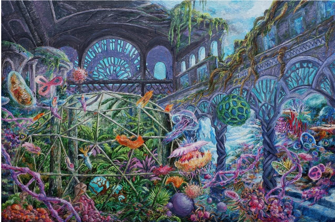
Equilibrium · 2020 · acrylic on canvas · 170 x 240 cm

Attachment: Some of the exhibit artworks: