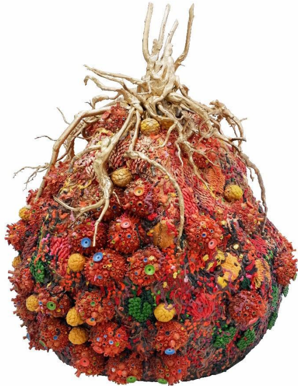
The Symptom_3 · 2020