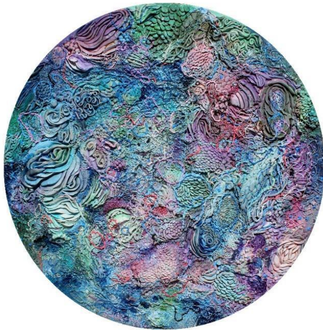
Derai · 2020 · clay and acrylic on canvas · D-100 cm