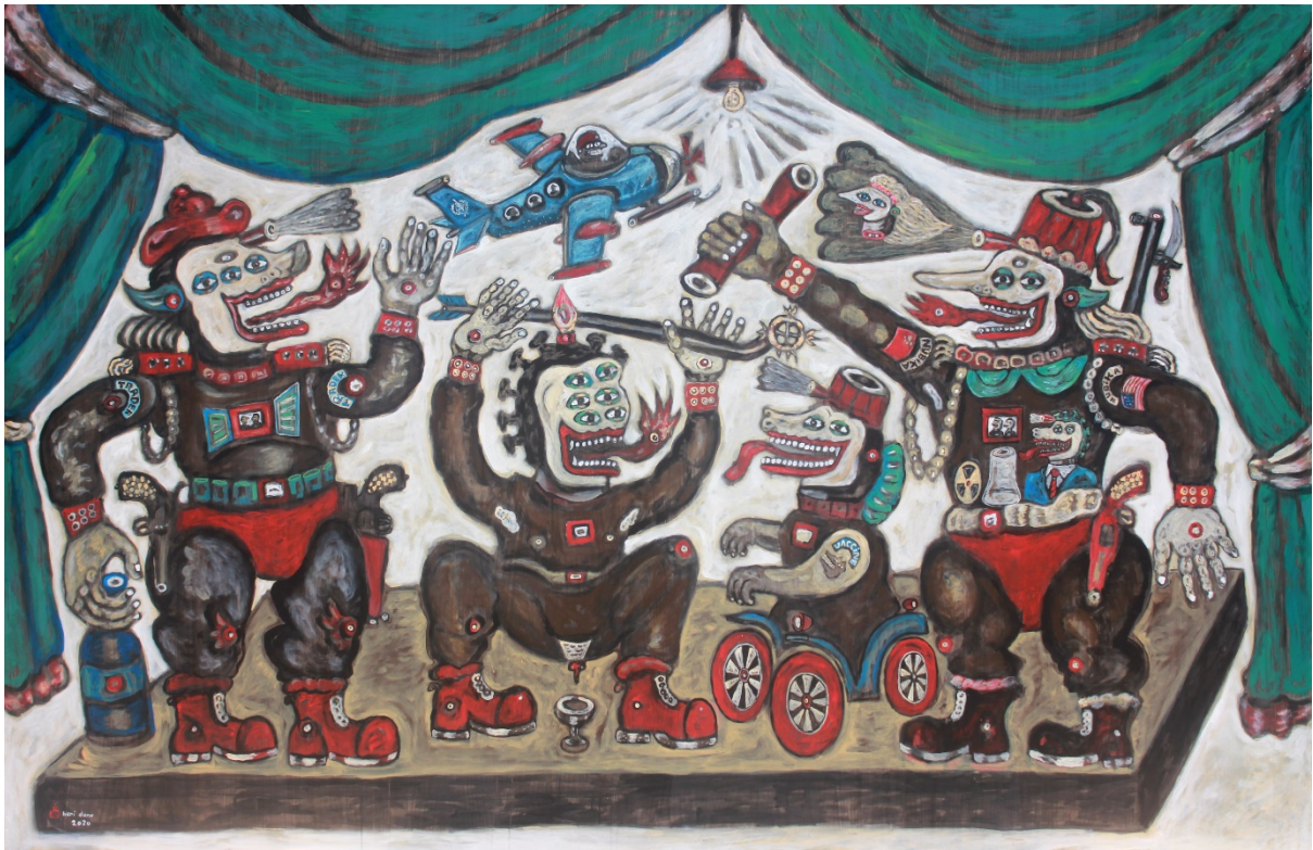
The Stage of Trade World War · 2020 · acrylic on canvas · 200 x 300 cm