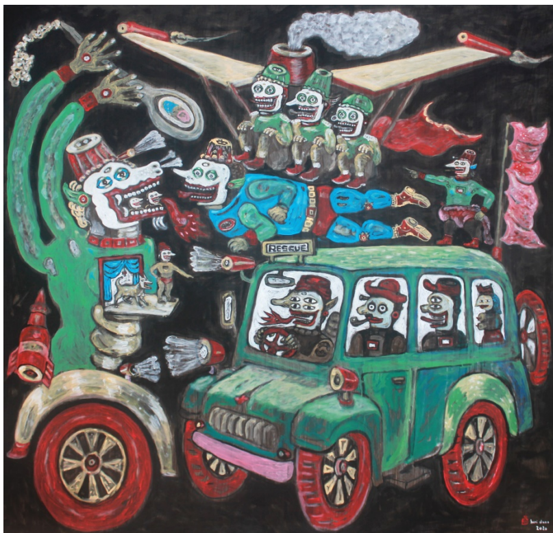
Three Wise Monkeys Find the Vaccine · 2020 · acrylic on canvas · 200 x 200 cm