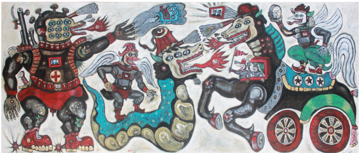
Battle of the Invisible Enemies · 2020 · acrylic on canvas · 180 x 420 cm