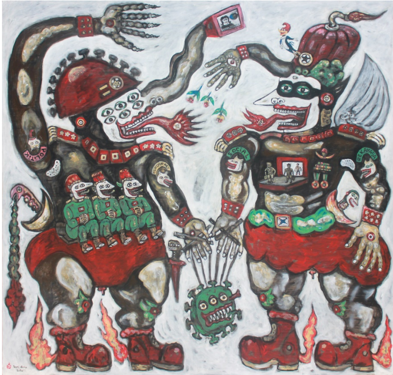
Corona as a Puppet · 2020 · acrylic on canvas · 200 x 200 cm

Attachment: Some of the exhibit artworks: