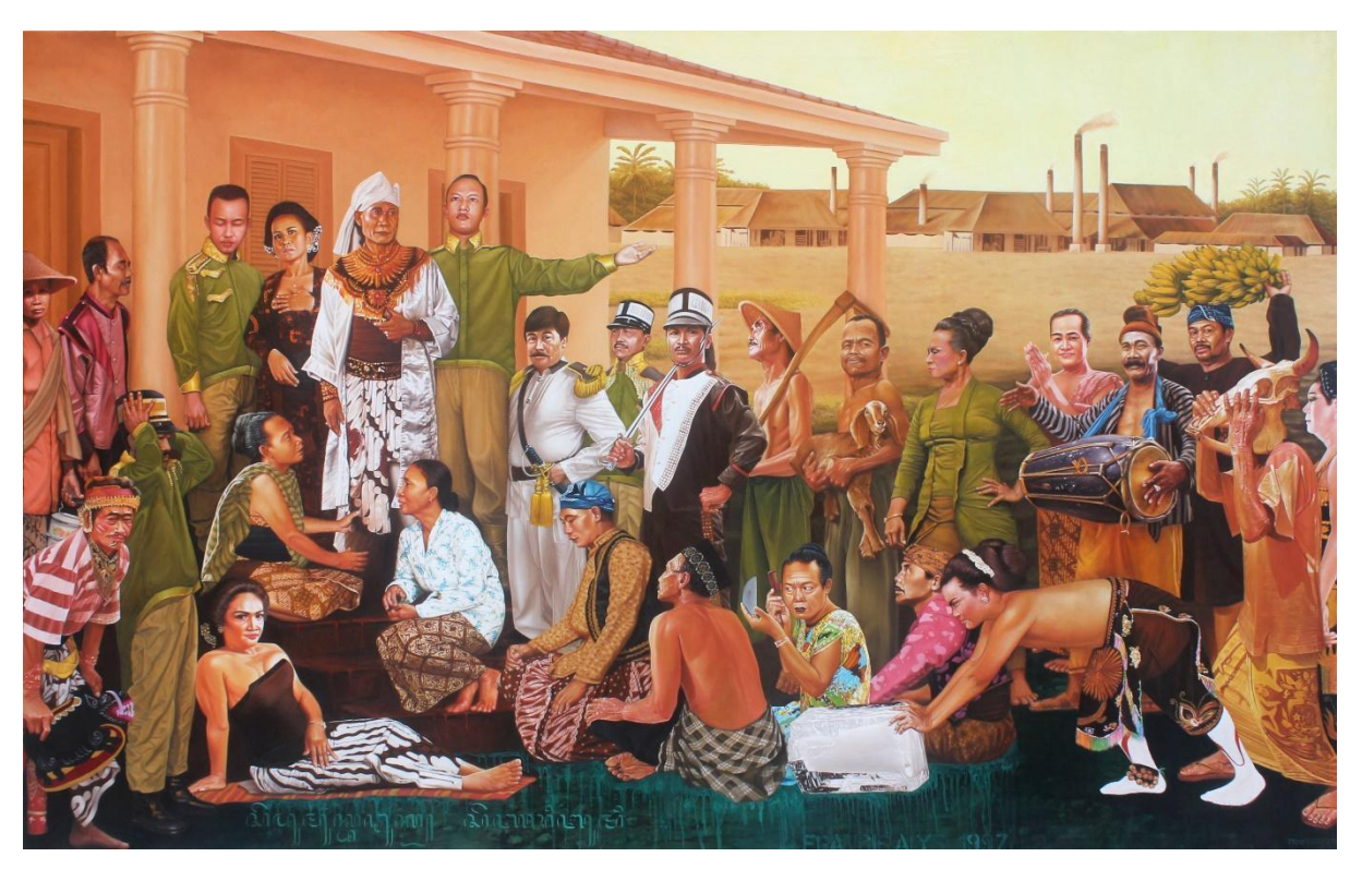
Moelyono \cdot BERKACA DULU \cdot 2020 \cdot Oil on canvas \cdot 170 x 270 cm

Attachment: Some of the exhibit artworks: