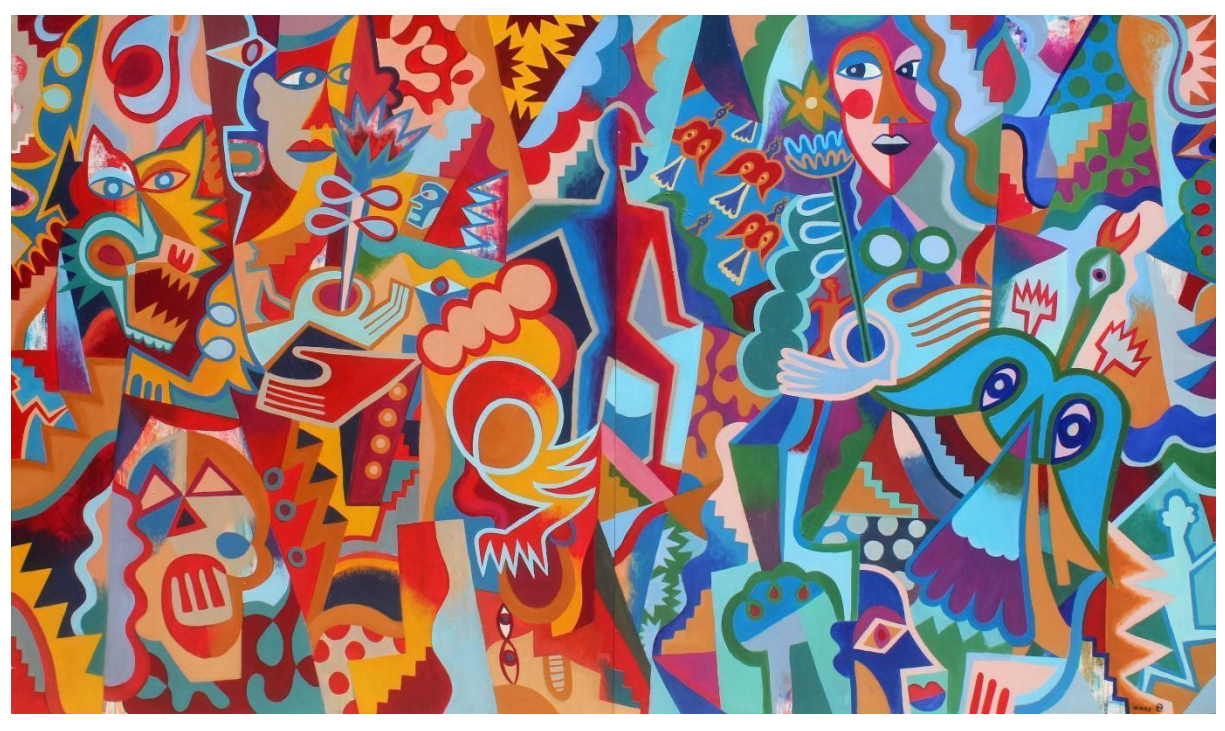
Abenk Alter · TRANSITION (EXPERIENCING THE GAP)· 2020 · Acrylic on canvas · 200 x 170 cm (2 panels)