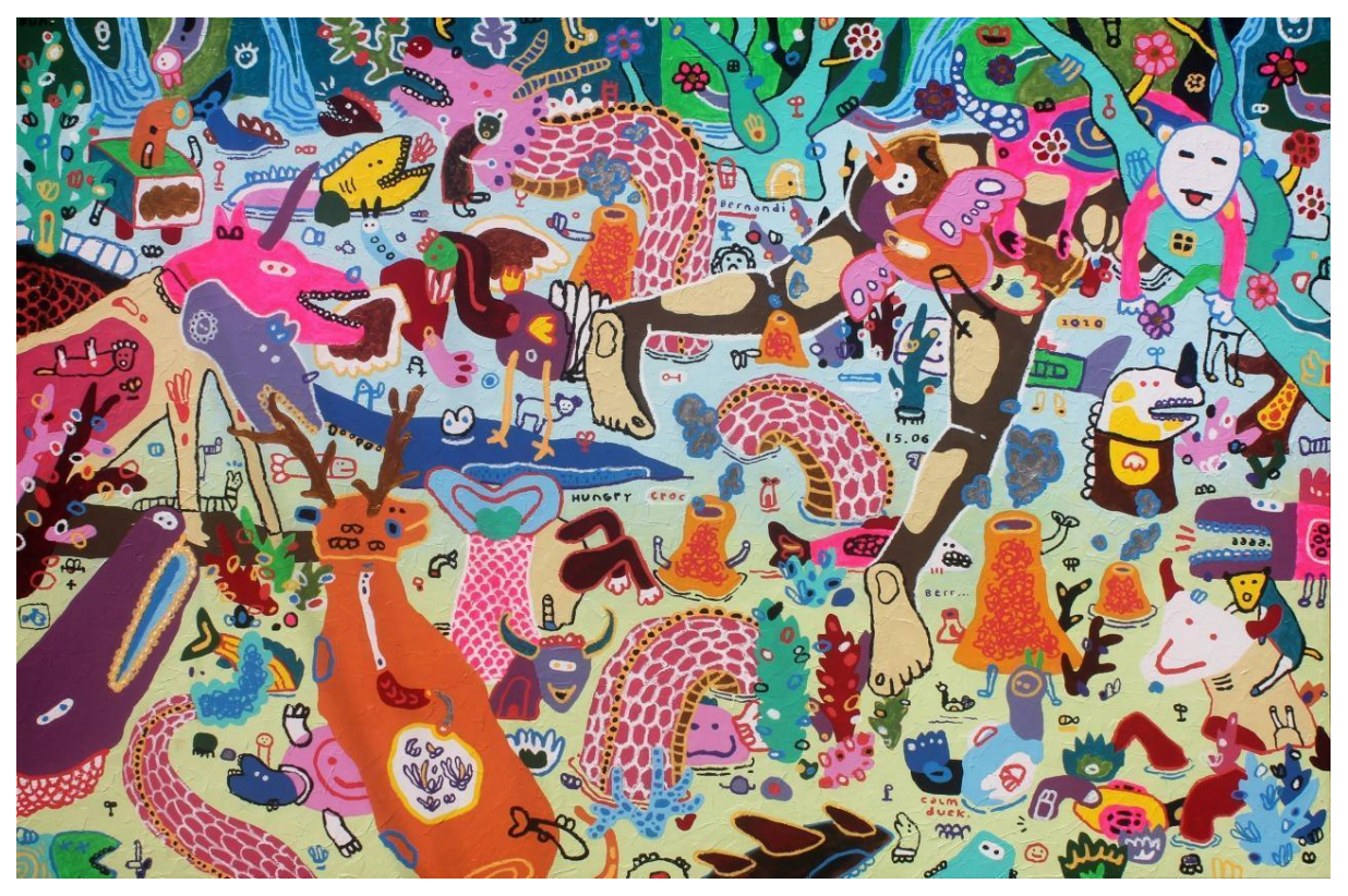
Bernardi Desanda · AT A LAKE SOMEWHERE IN HIDDEN WORLD · 2020 · Mixed media on canvas · 170 x 250 cm